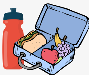
water bottle and lunch box