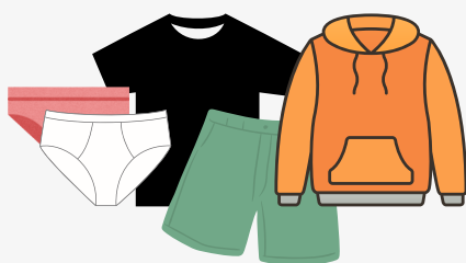
spare clothes, underwear and a jumper.